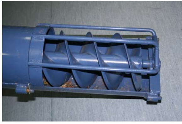
Lugs welded to the inner guard to attach the Detail of lug and pin to attach outer guard outer guard