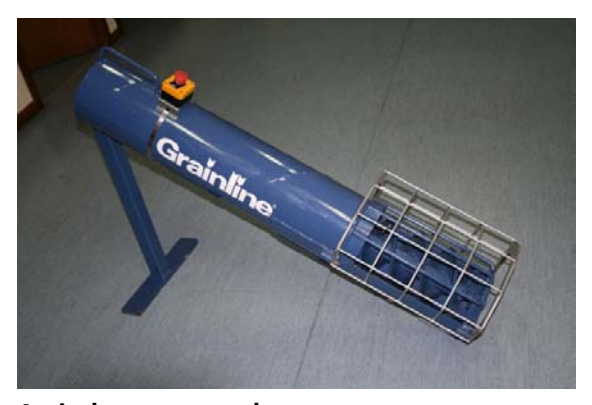
An industry example